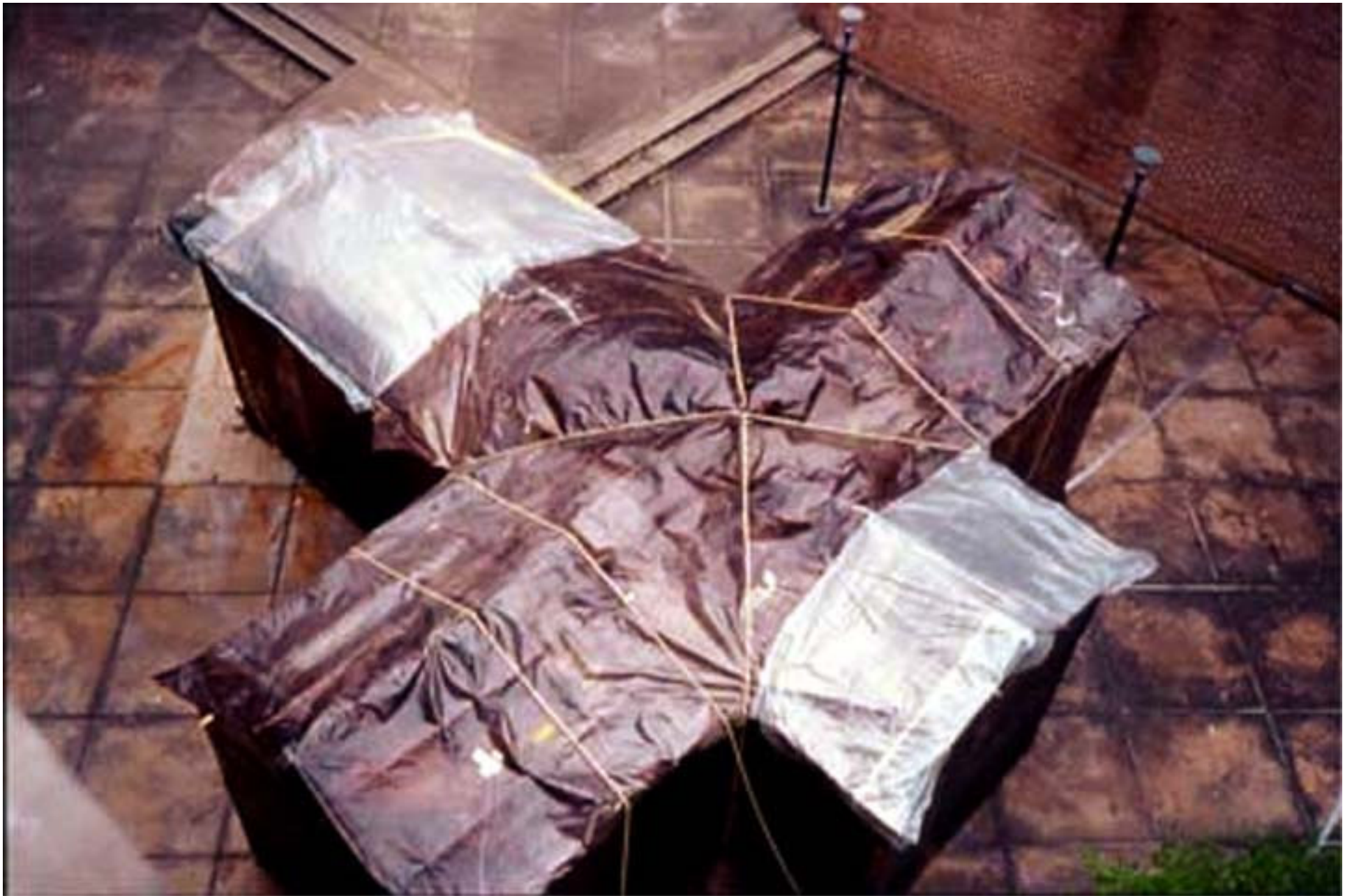
The installation in the Art's Courtyard.