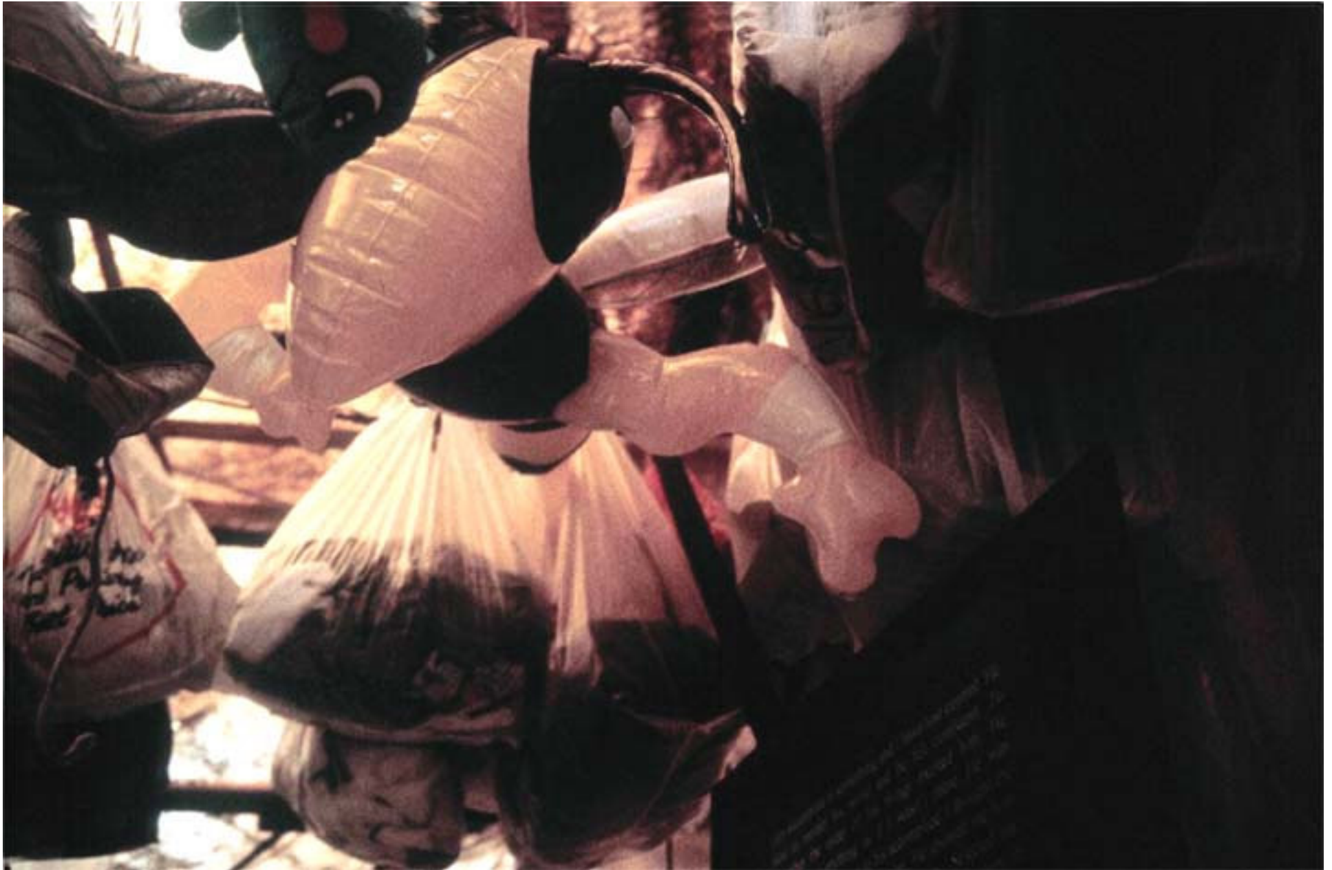
Street Vendor Section (ceiling detail)