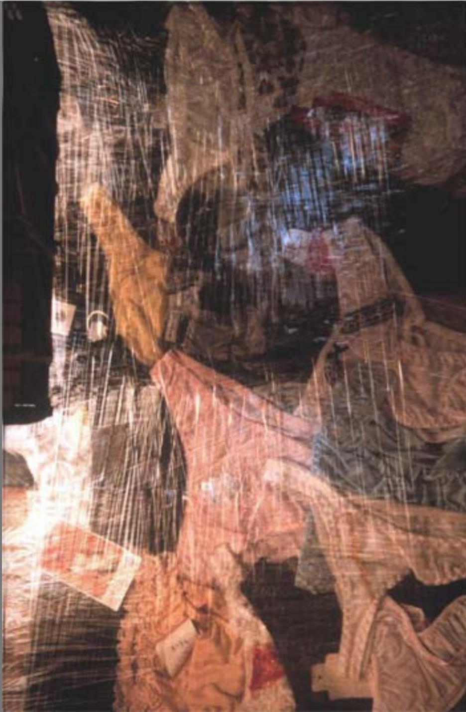
Street Vendor Section (detail)