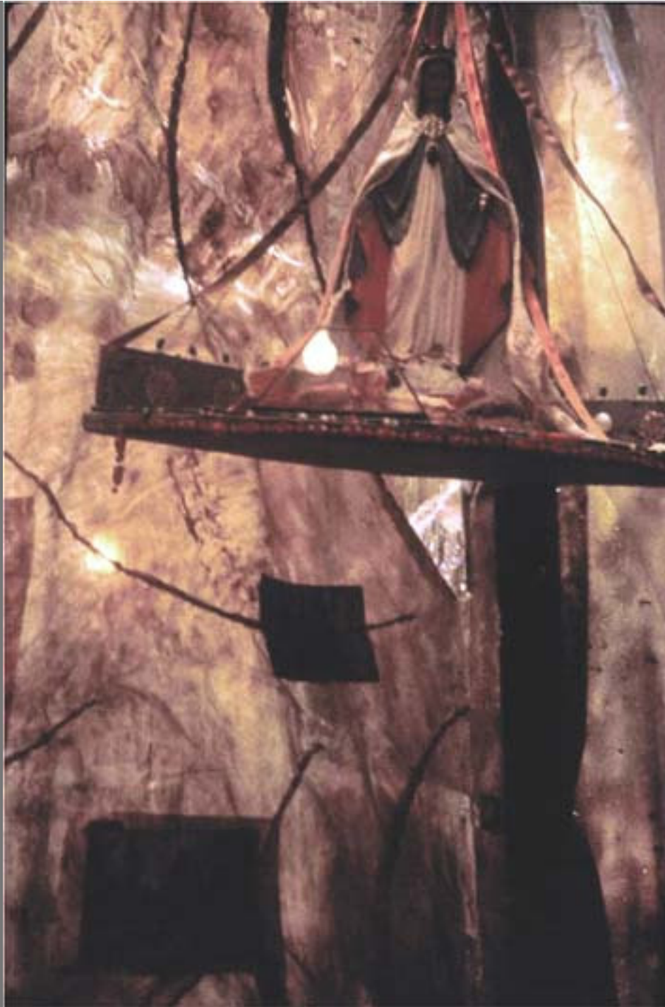
Altar at the cross