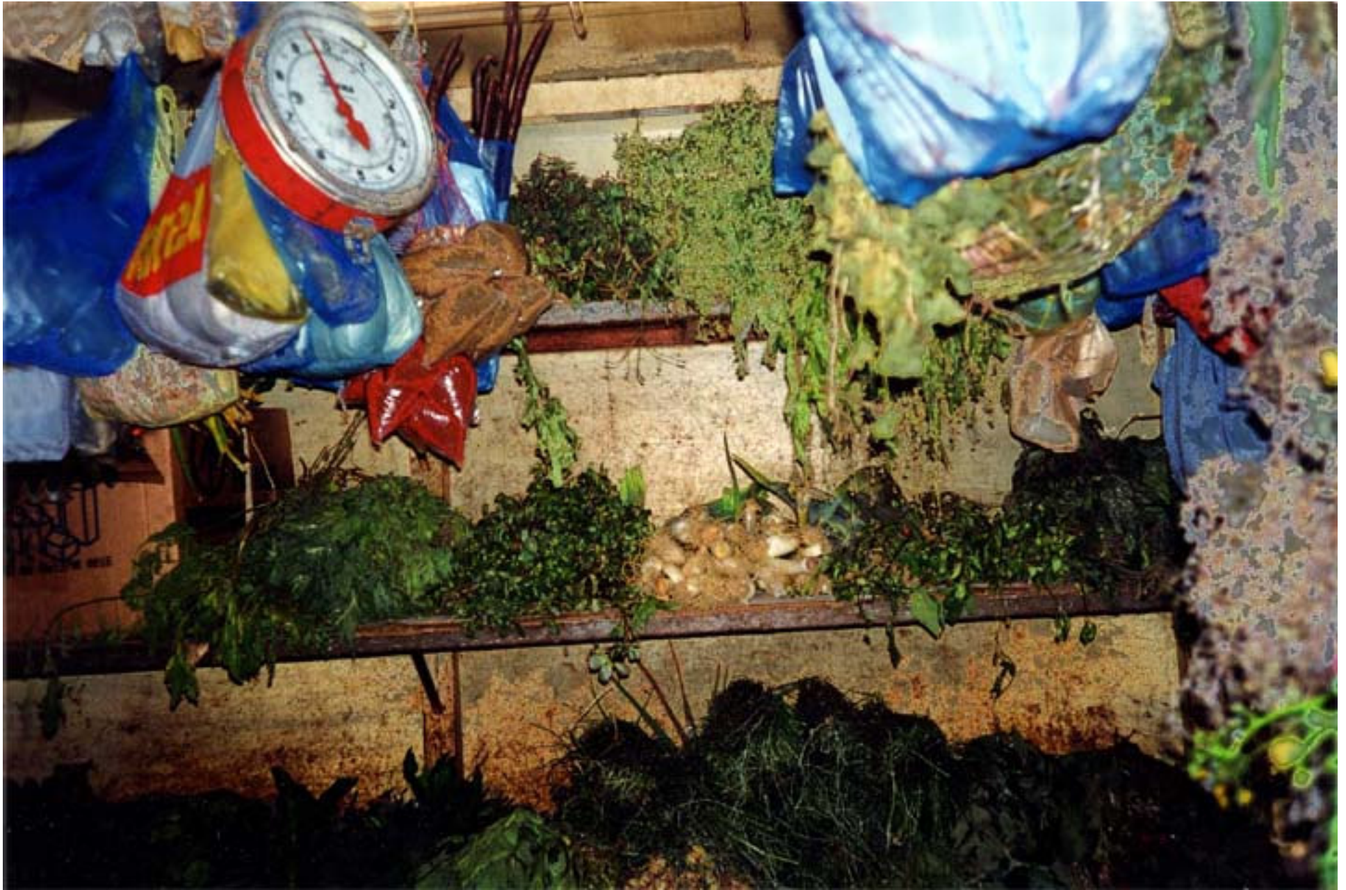
Herbs and vegetables at the Mercado de Quinta Crespo