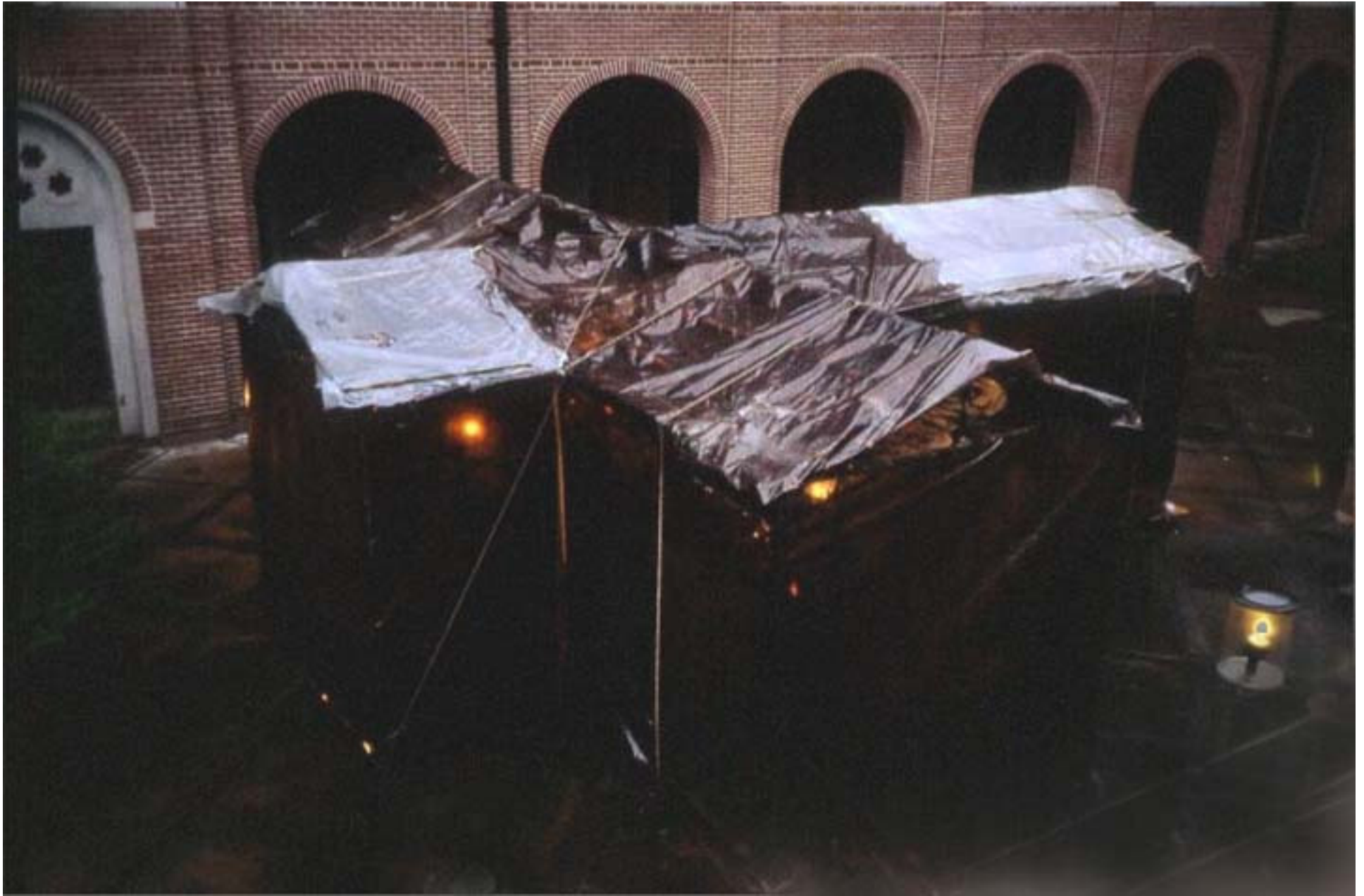
Between Arte and Anthropology, Rice University.