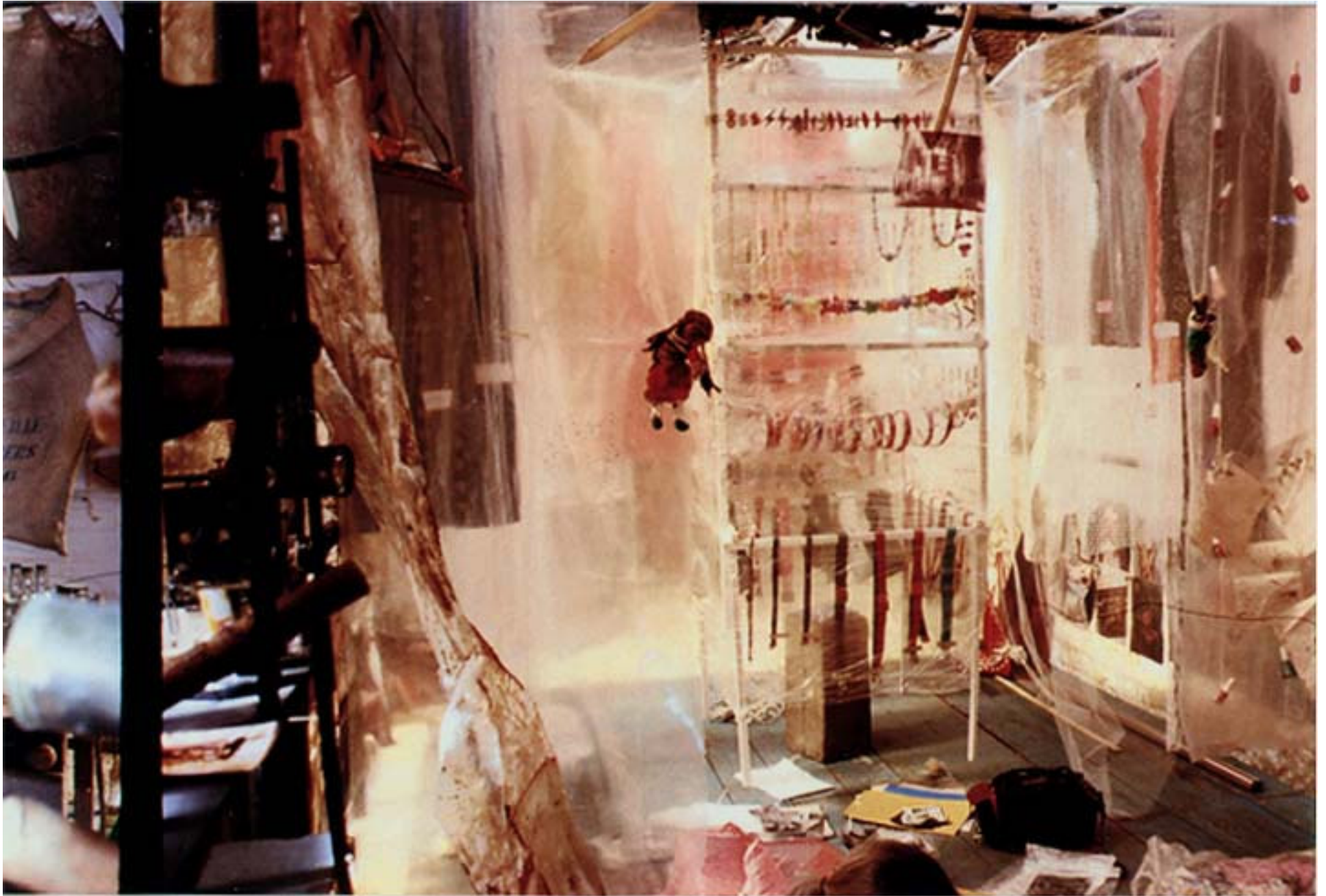
The Female Vendors Section