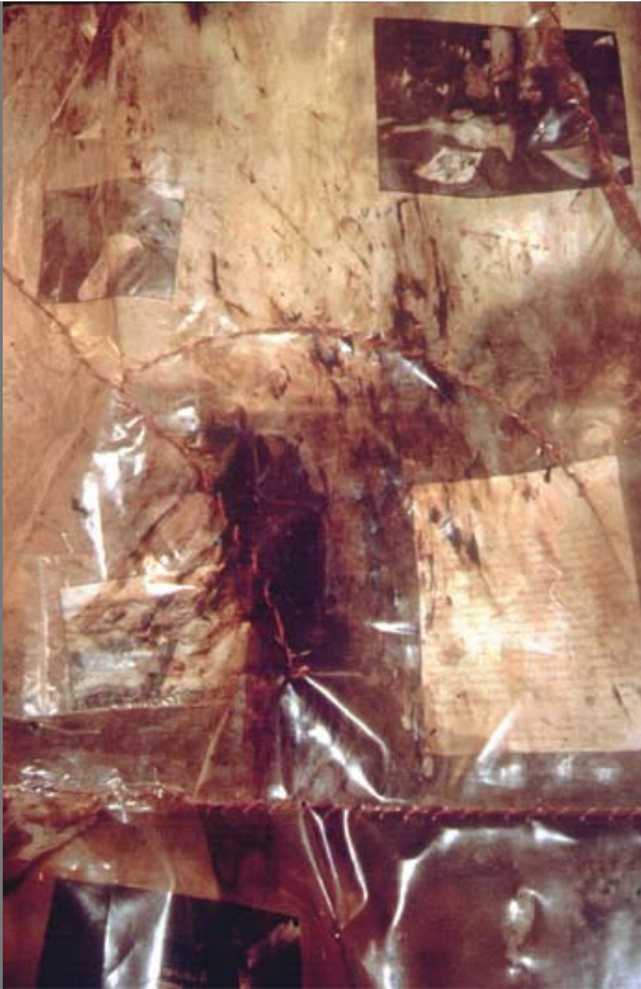
The ethnographer's place (detail)