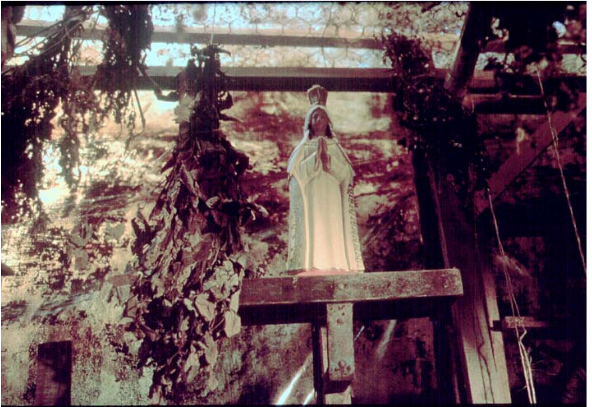
Herbs and Altar