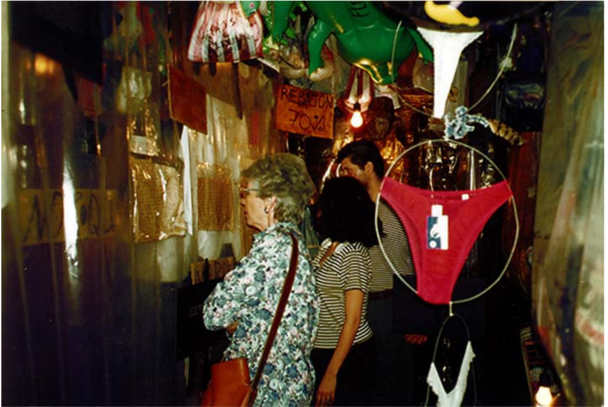
Reading the street vendors notes