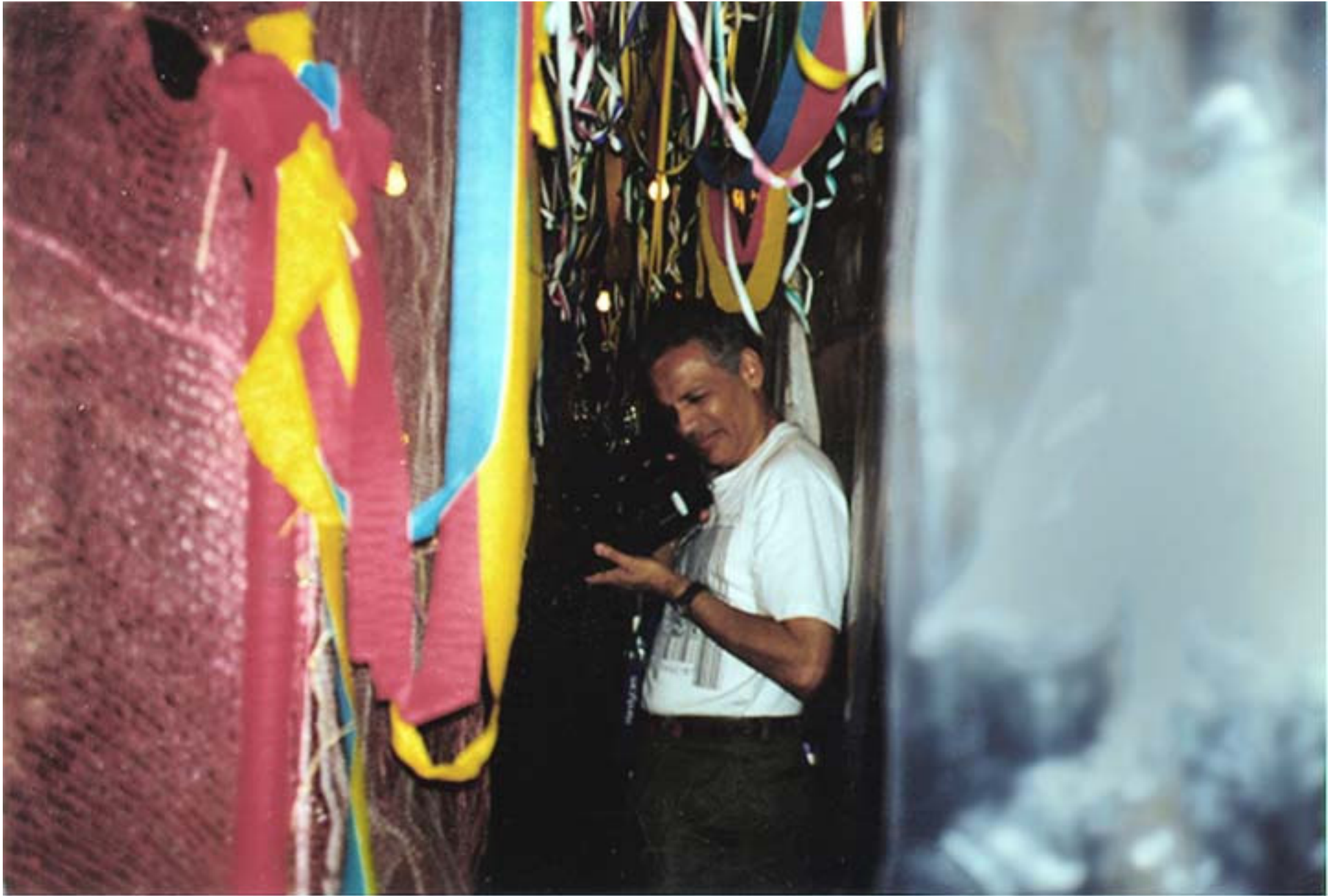
At the party, already going out