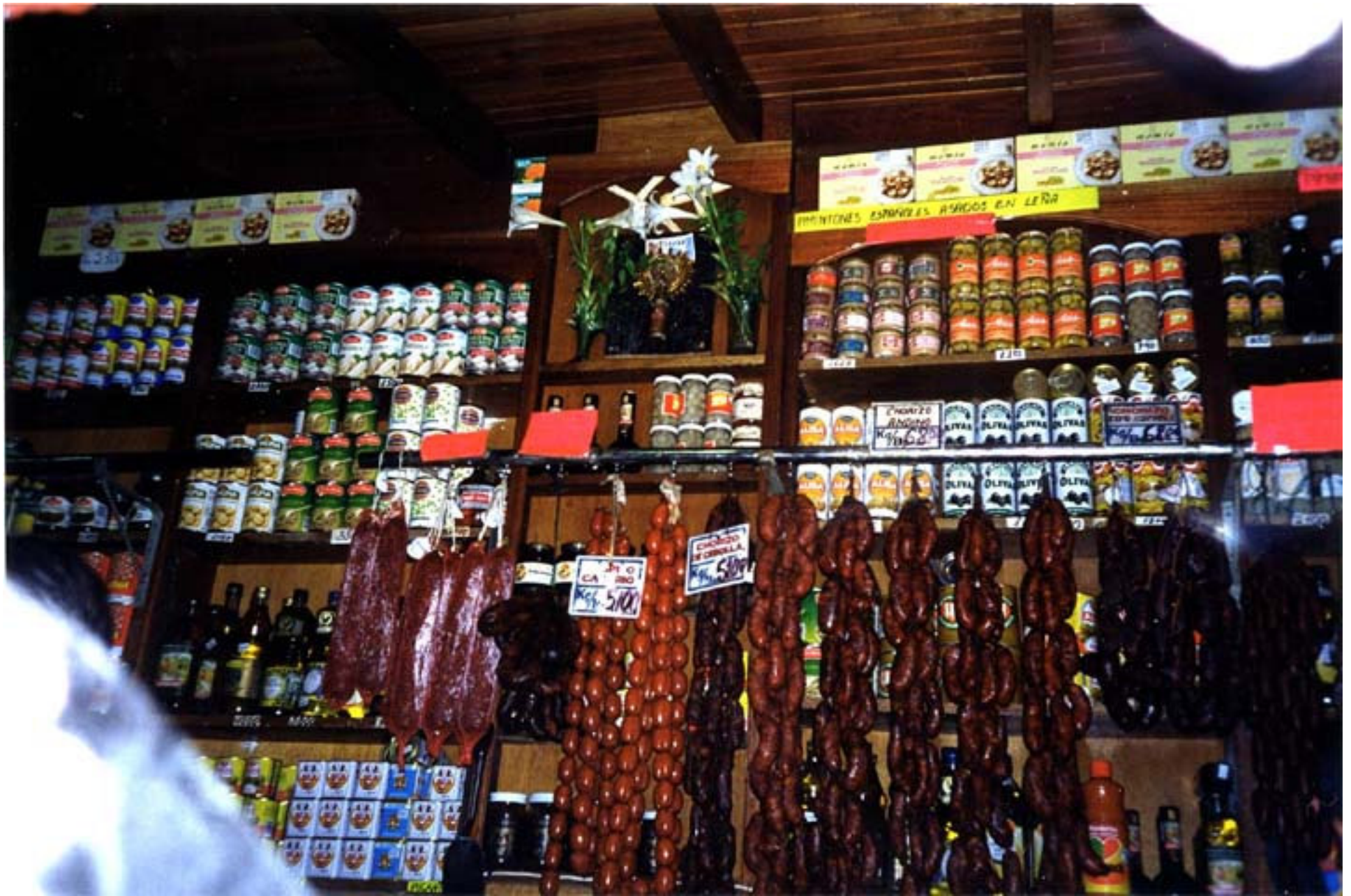
At the Mercado de Quinta Crespo