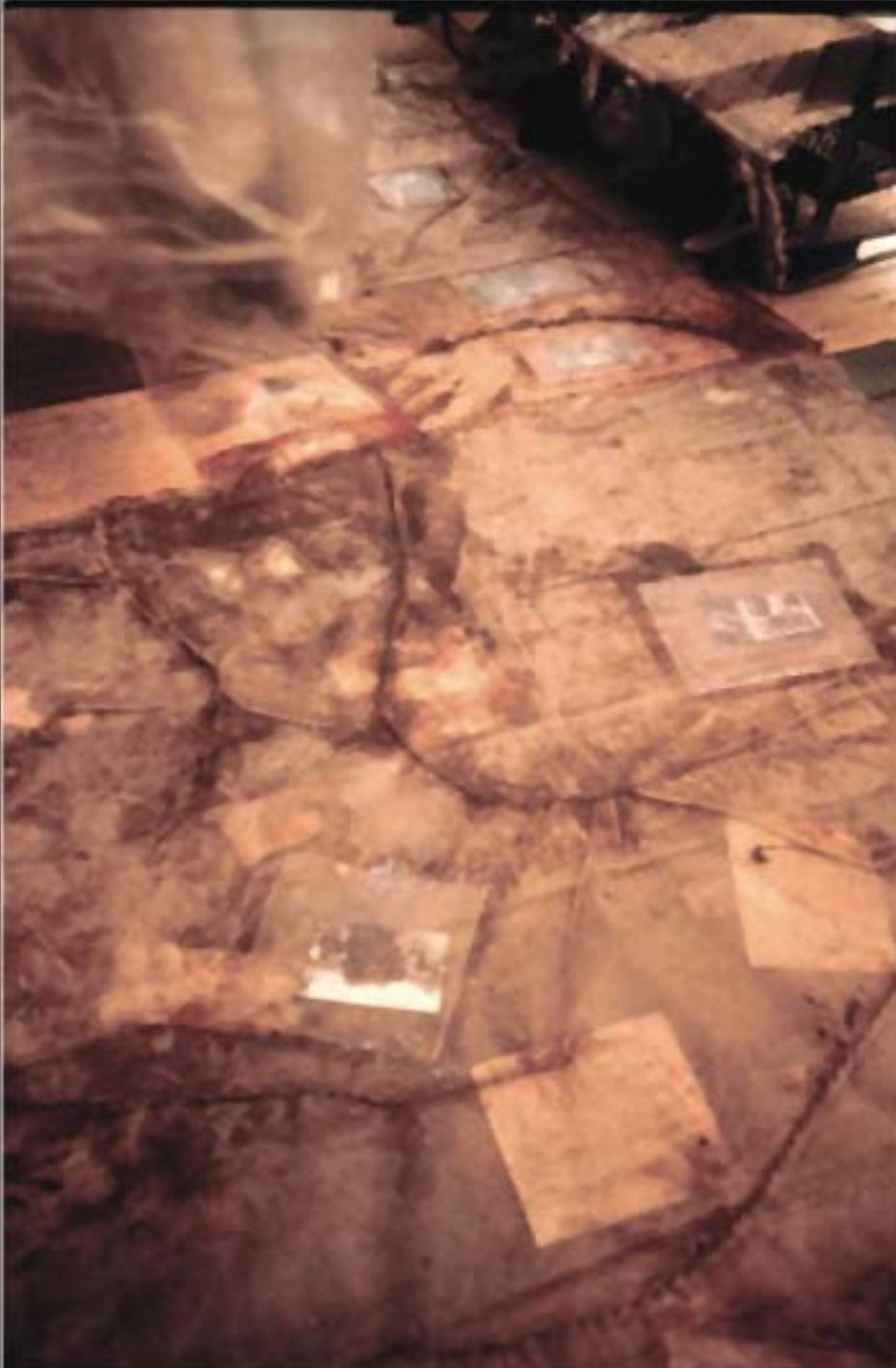
The floor at the cross