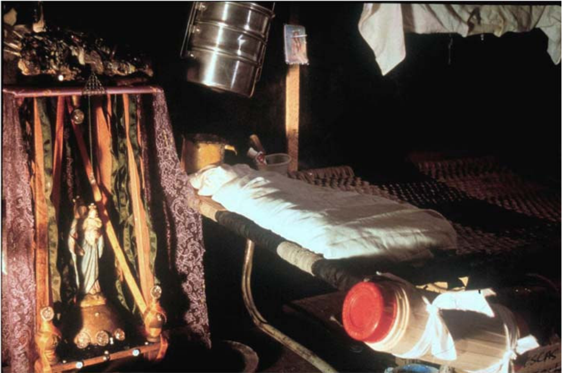
Street Vendor Section (bed and altar)