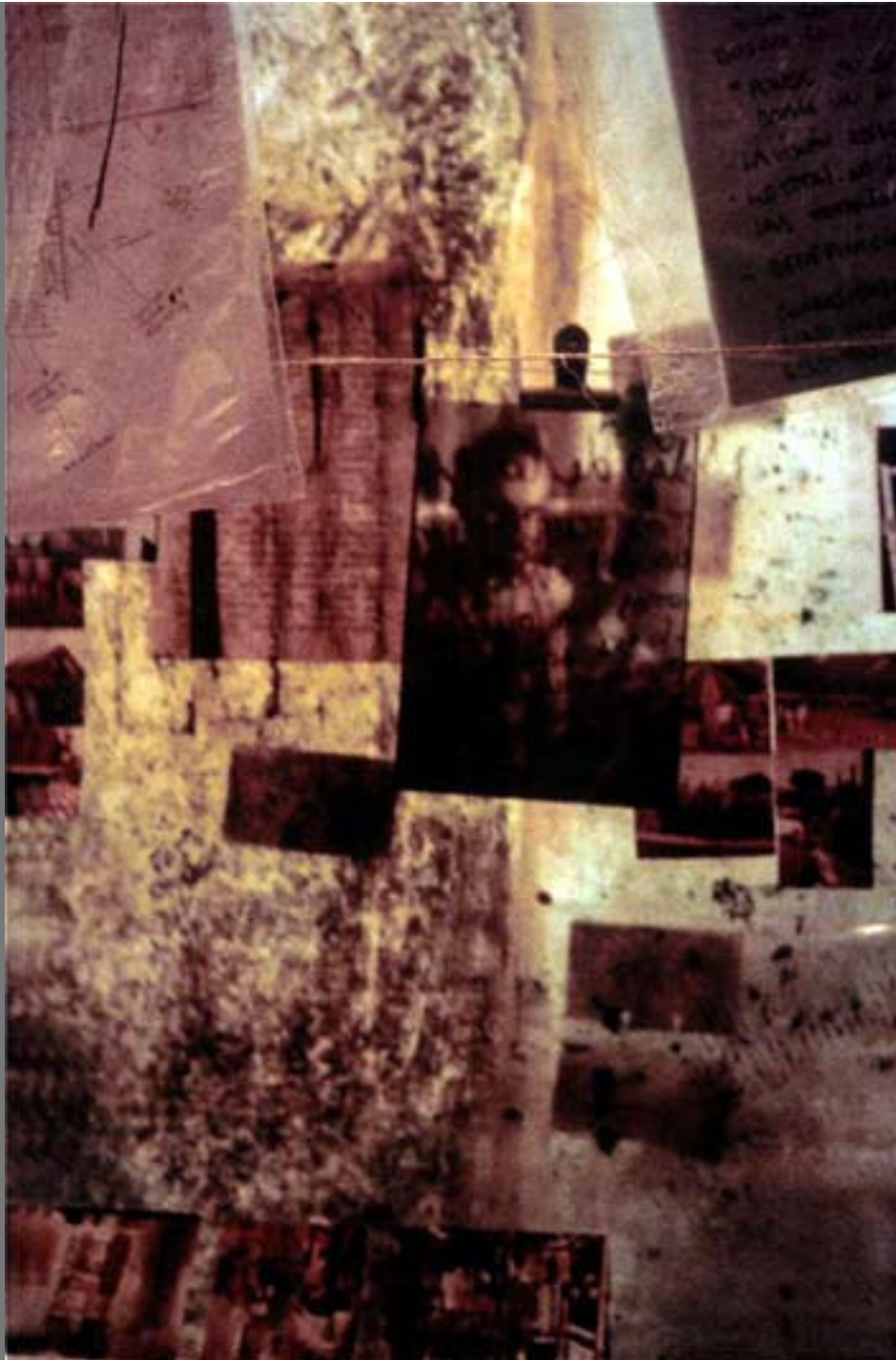
The ethnographer's notes