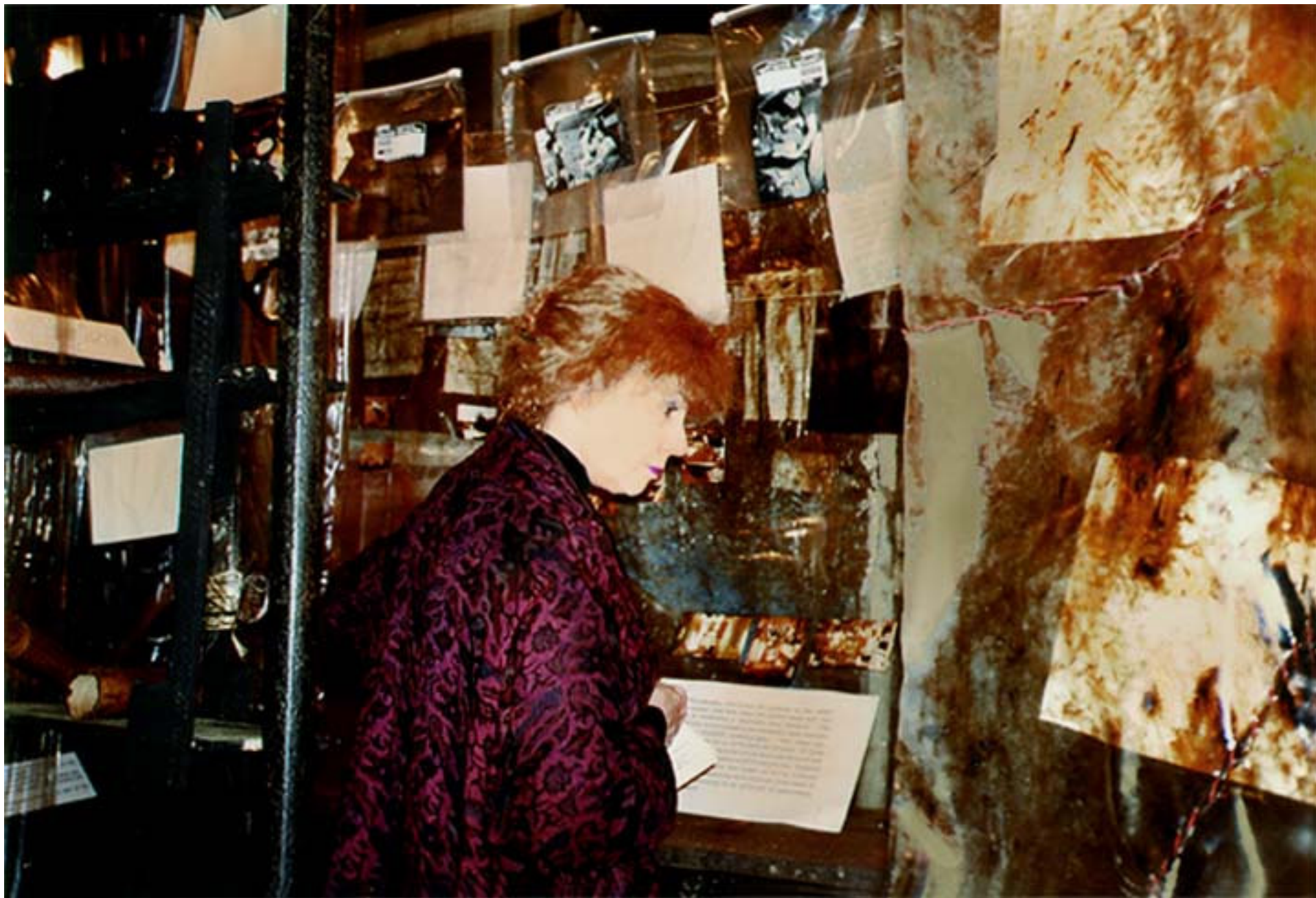
Looking at the ethnographer's place