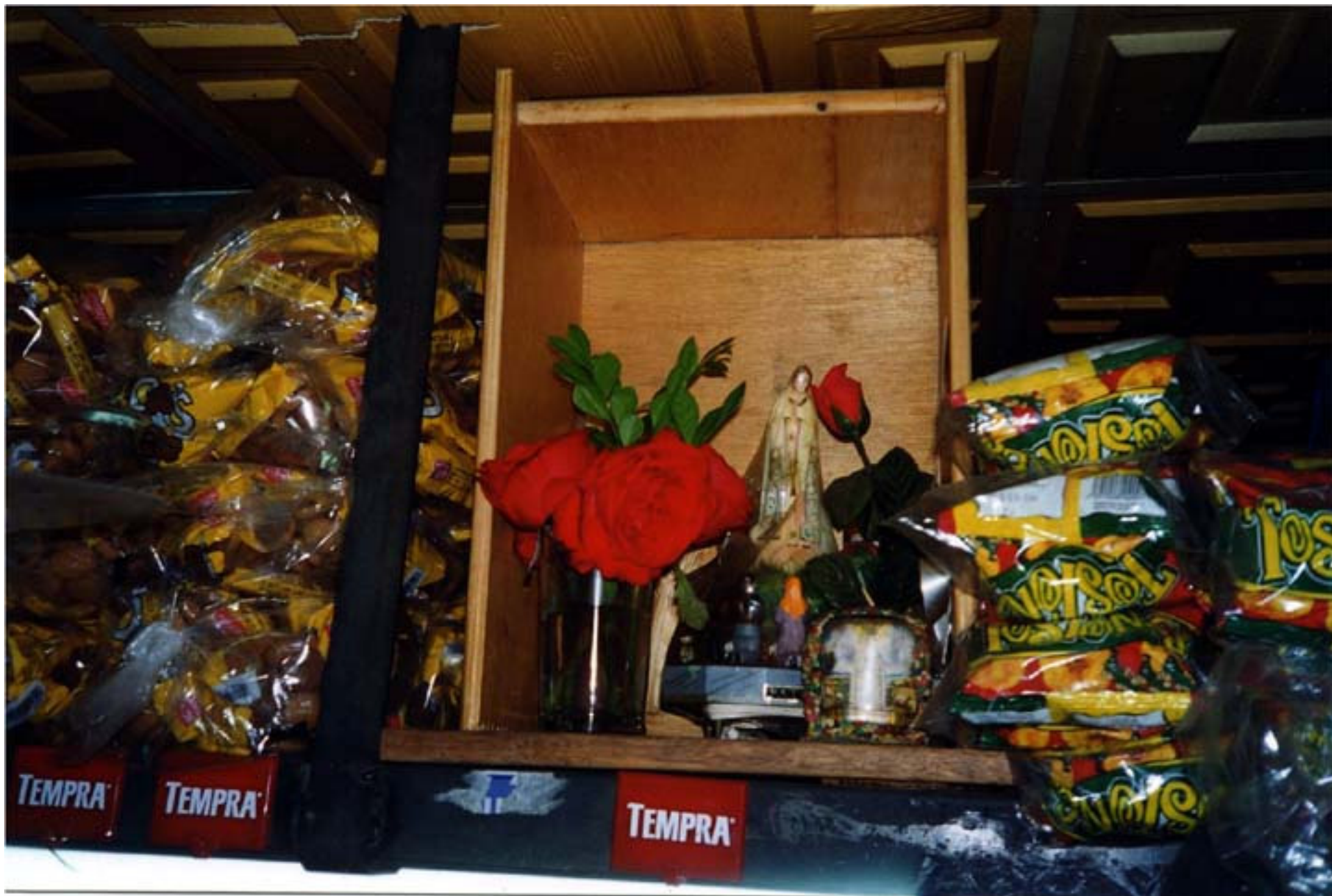
Mercado de Quinta Crespo