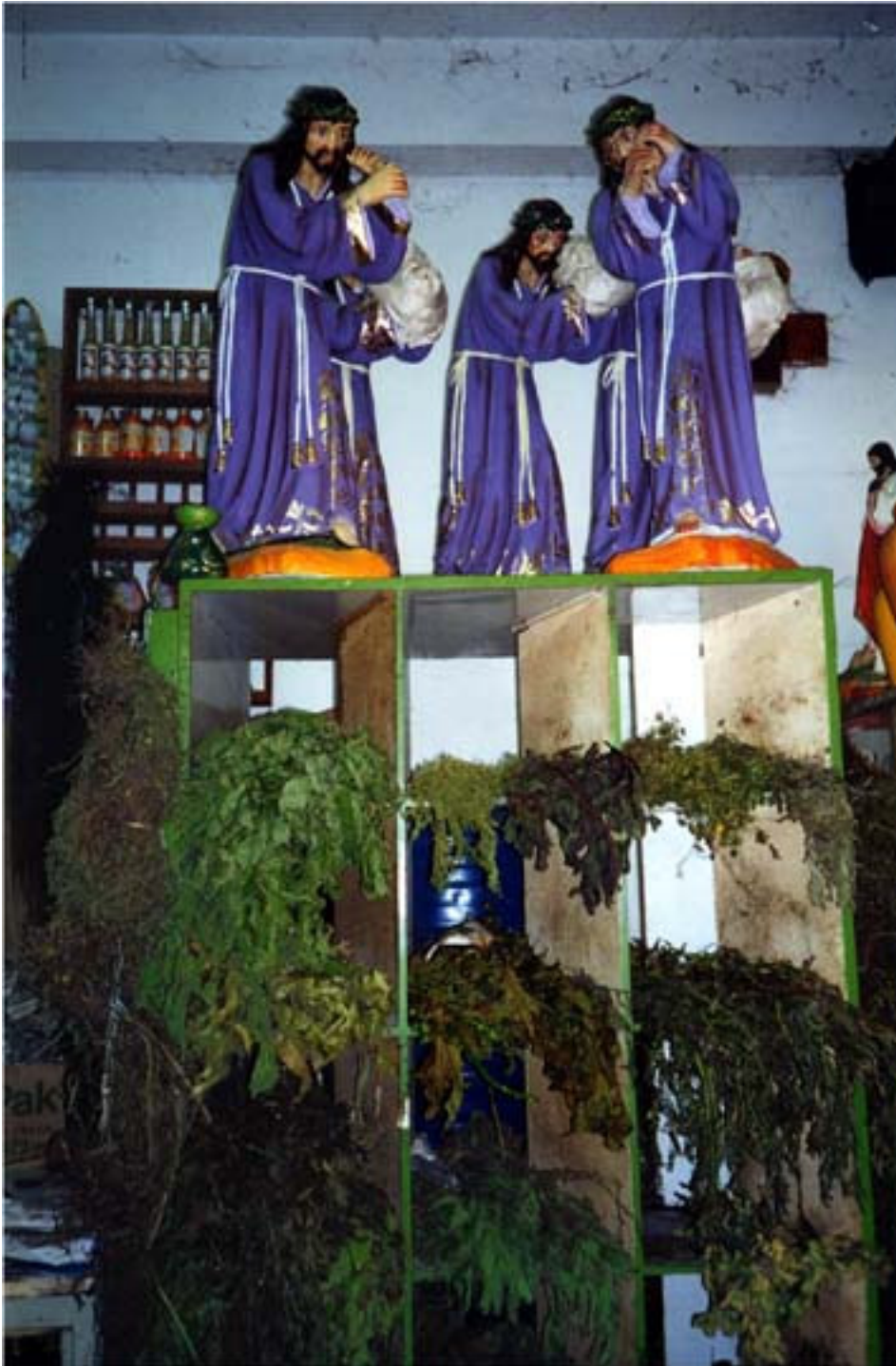
Saints and herbs, Quinta Crespo