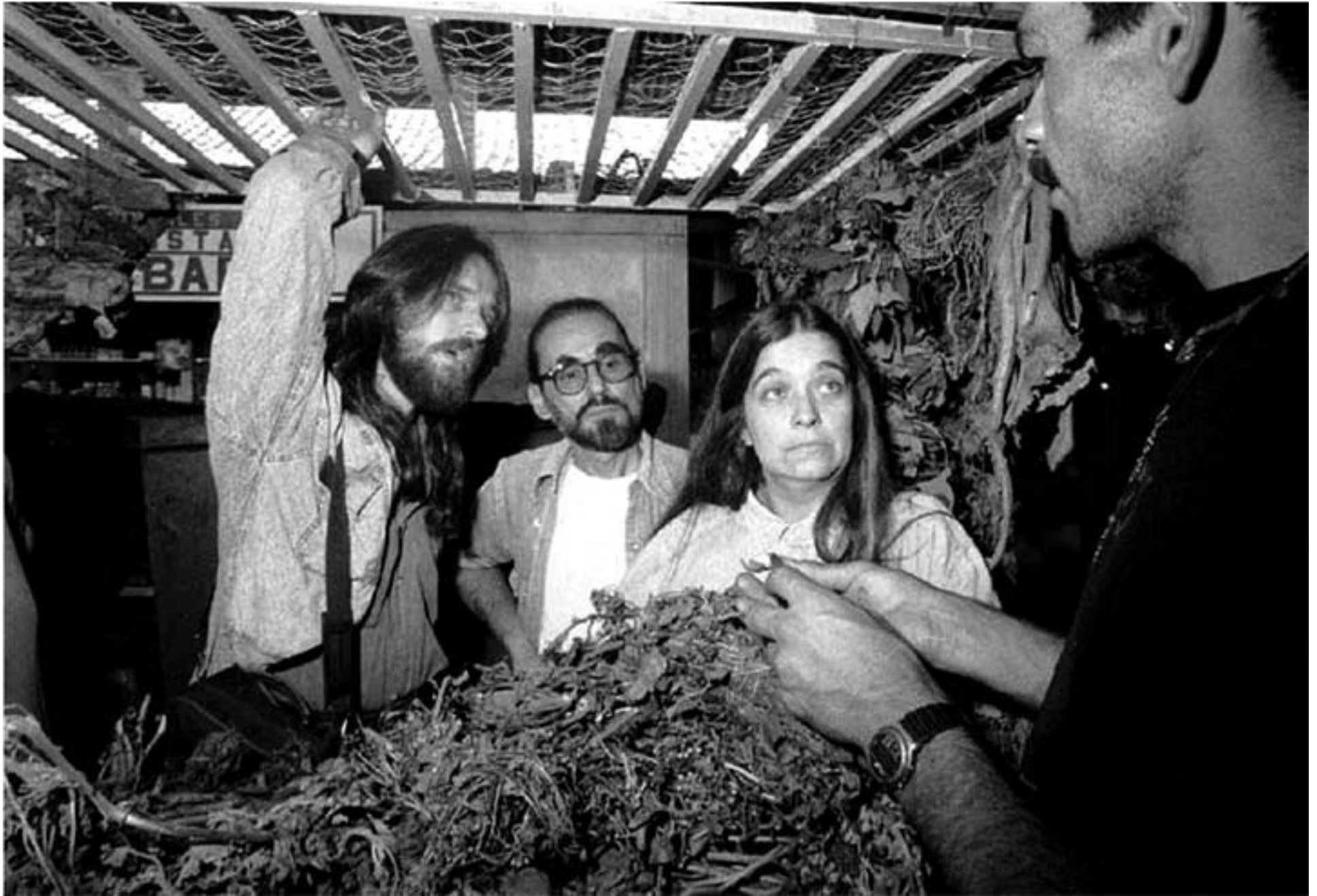
Fieldwork at the Maracay Marketplace