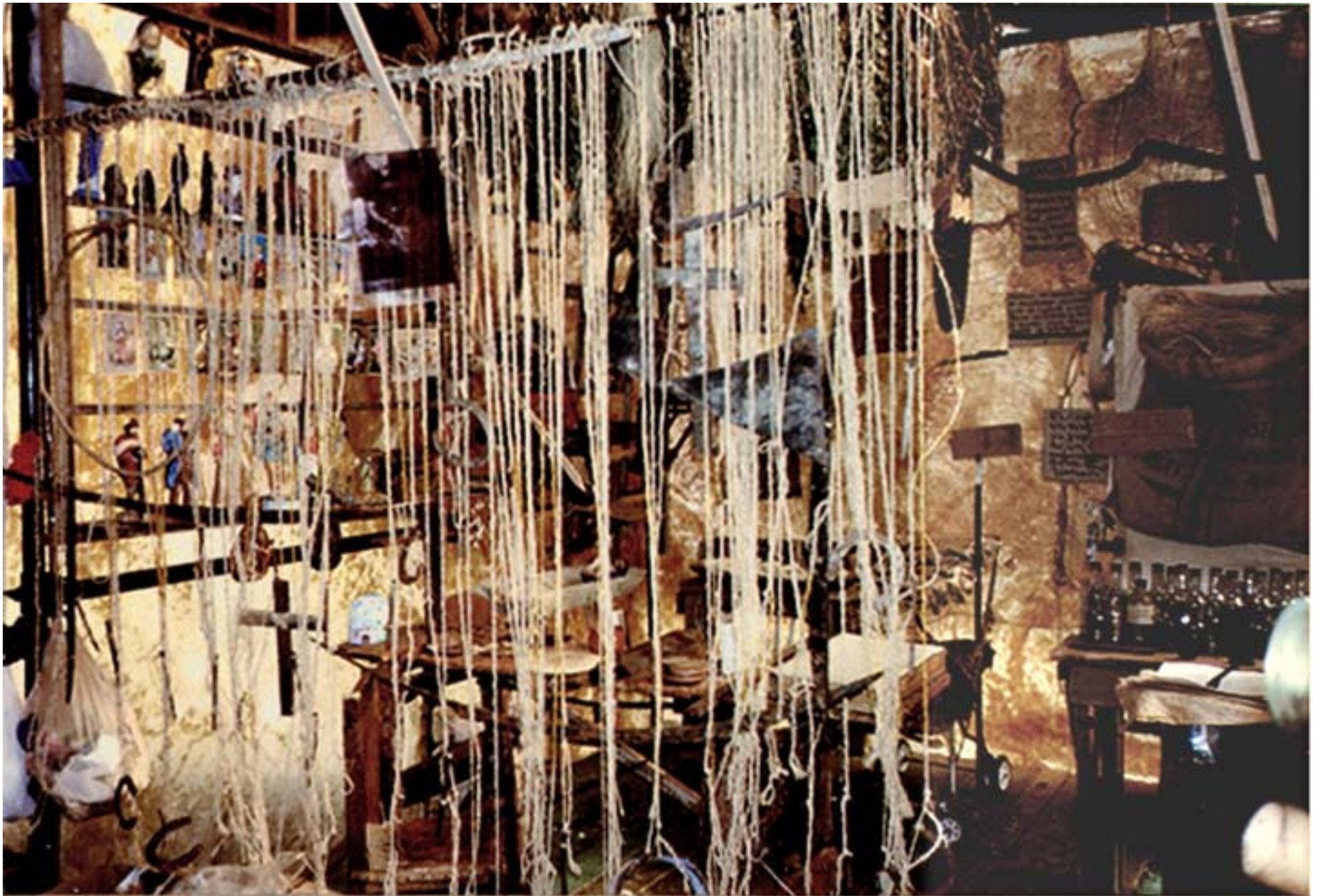
Entering the Yerbatero Section