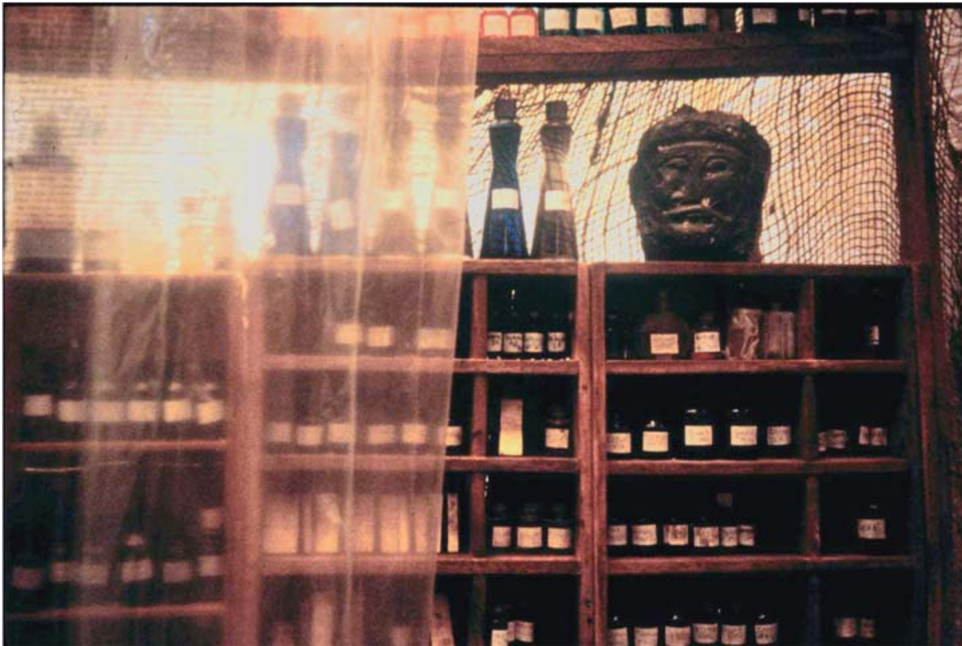
Potions at the Yerbatero Section