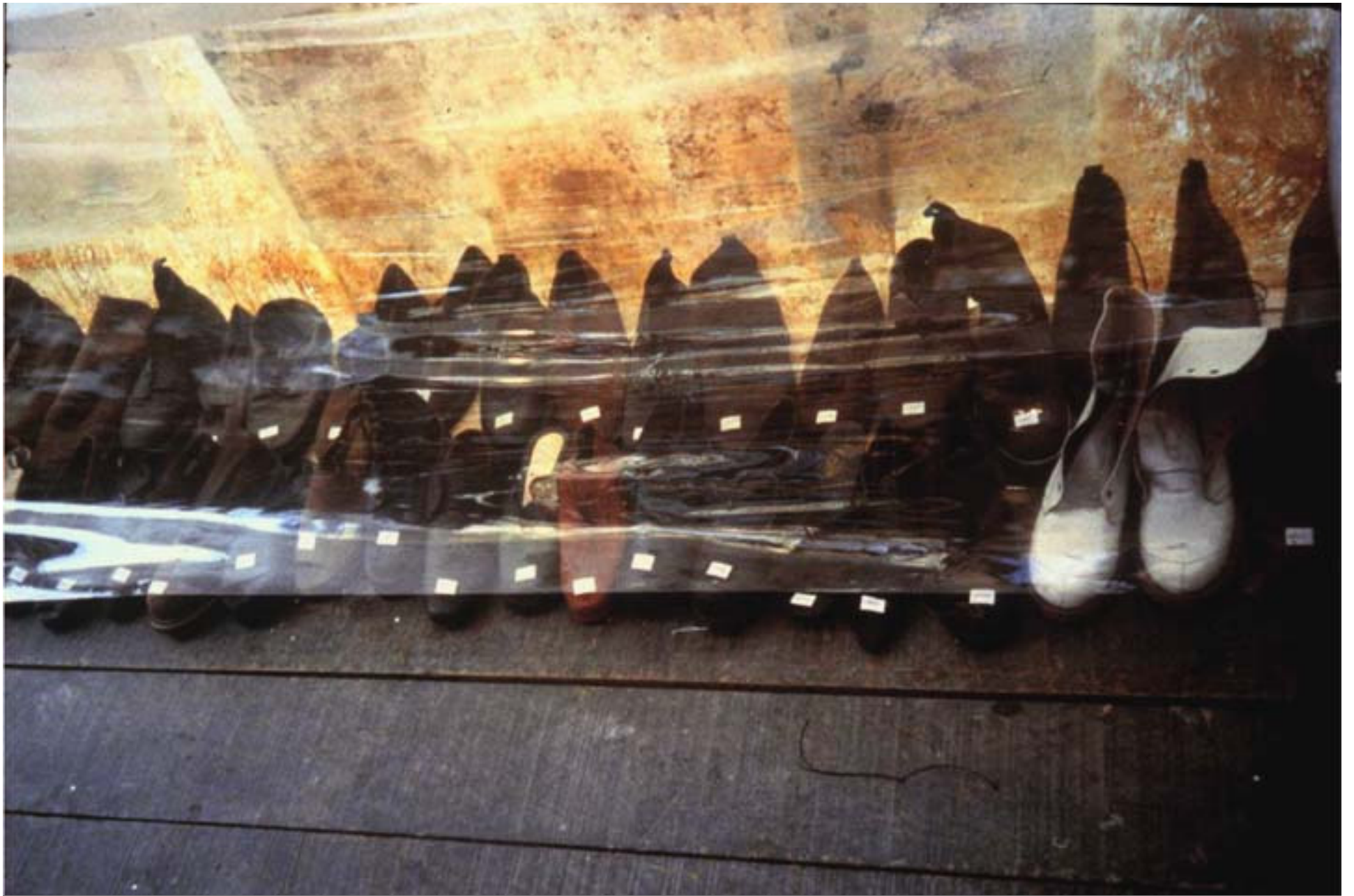
The shoes at the ethnographer's place