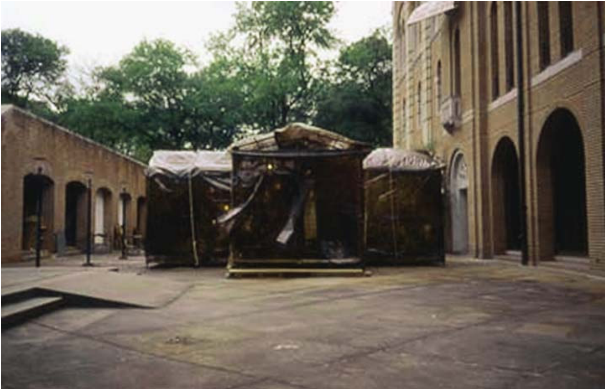
Entering El Mercado de Acá