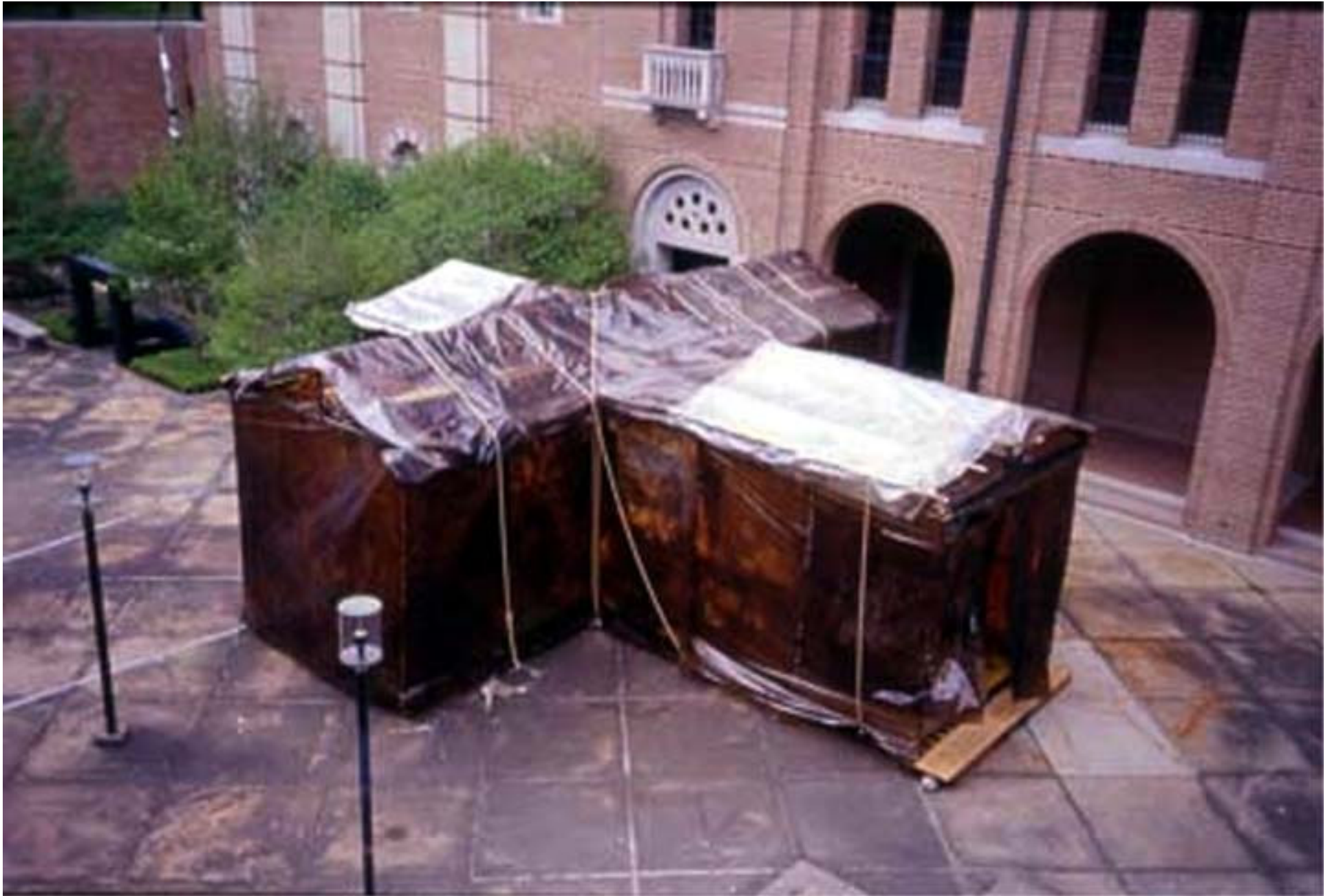
Between art and Anthropology, at Rice University, Houston.